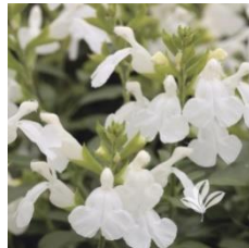
flower on white autumn sage